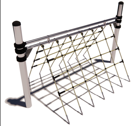
Priekšpuse Front view Aizmugure Back view