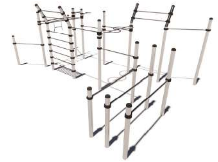
Priekšpuse Front view Aizmugure Back view